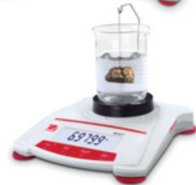
Scout shown with optional Density Determination Kit